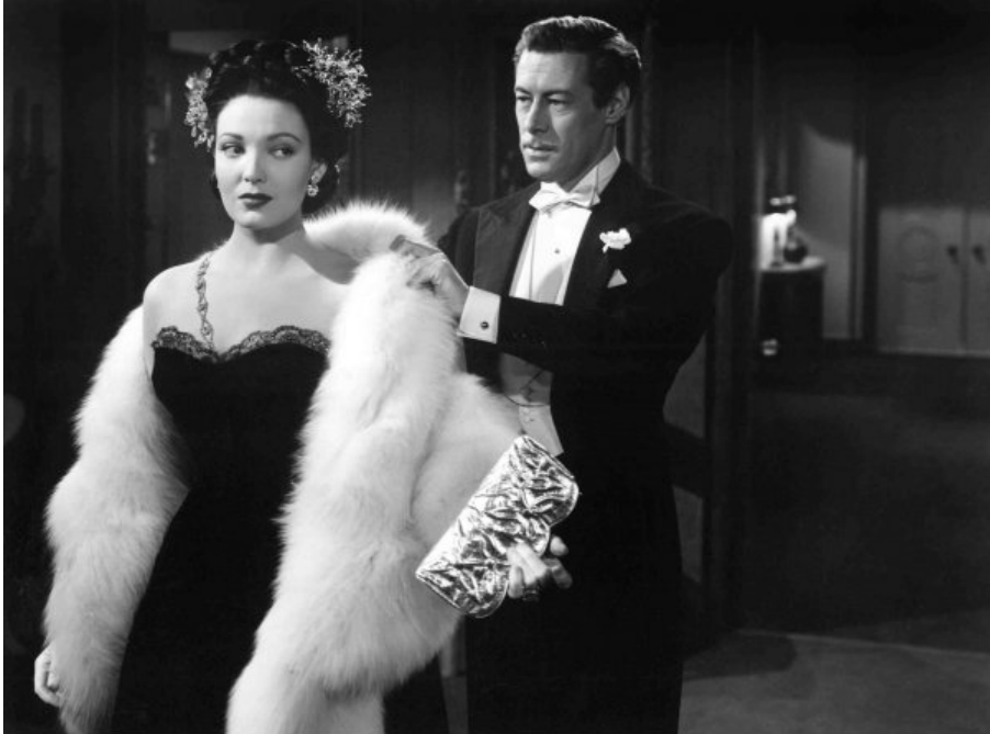
Unfaithfully Yours (1948) Directed by Preston Sturges Starring Rex Harrison, Linda Darnell (as Daphne De Carter), Rex Harrison (as Dr. Alfred De Carter)

I love old theaters that have been preserved and/or restored so that one can get a feeling of what moviegoing was like before the heyday of television and the multiplex theater. Three theaters come to mind, in order of preference: the Music Box in Chicago, the Senator in Baltimore, and the Cinerama Dome in Hollywood.